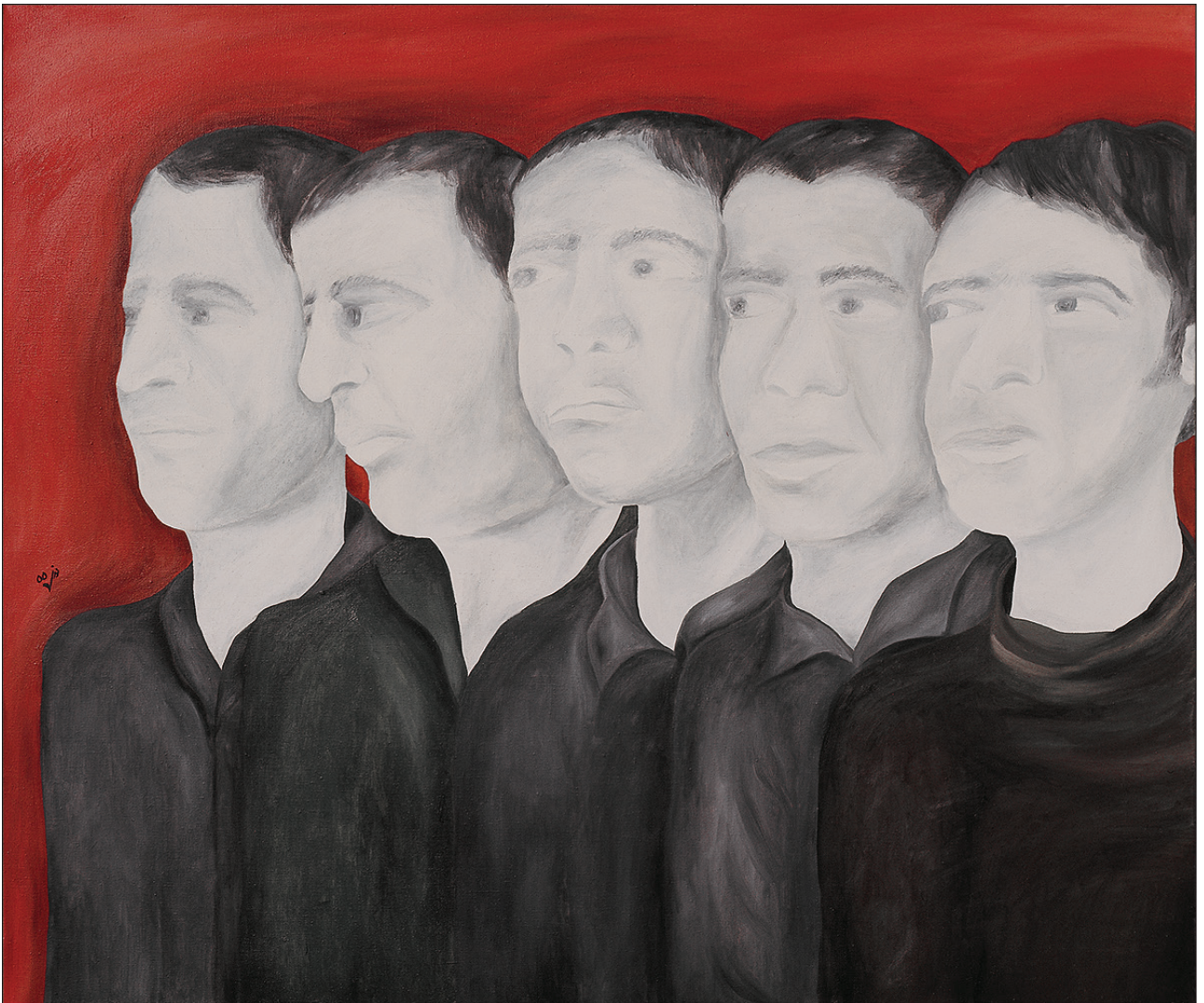
Untitled 1976 110x130 cm Oil on canvas