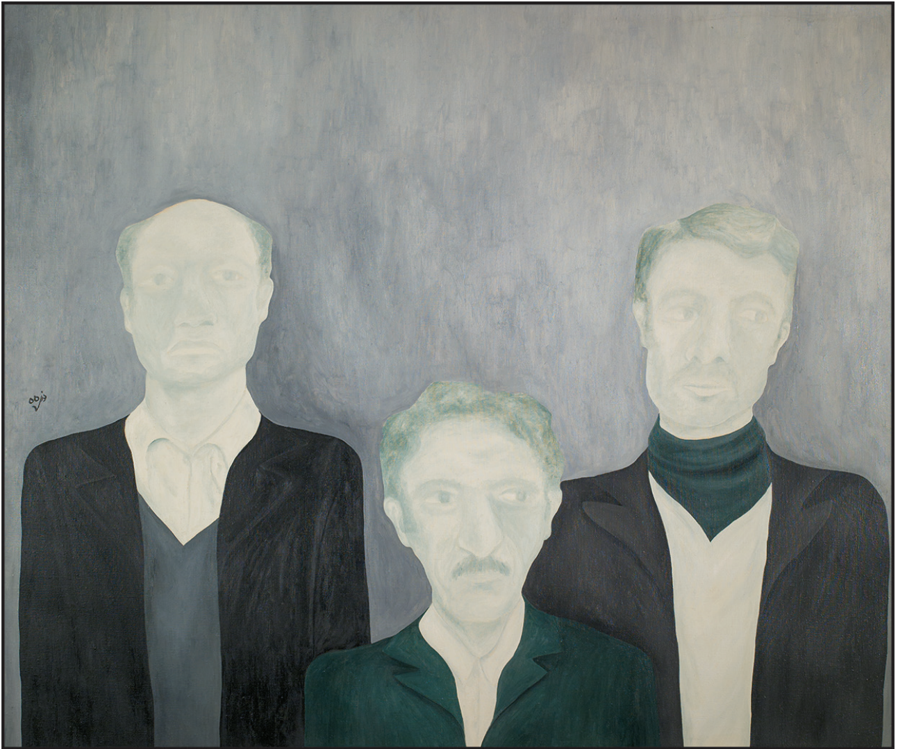
Untitled 1976 110x130 cm Oil on canvas