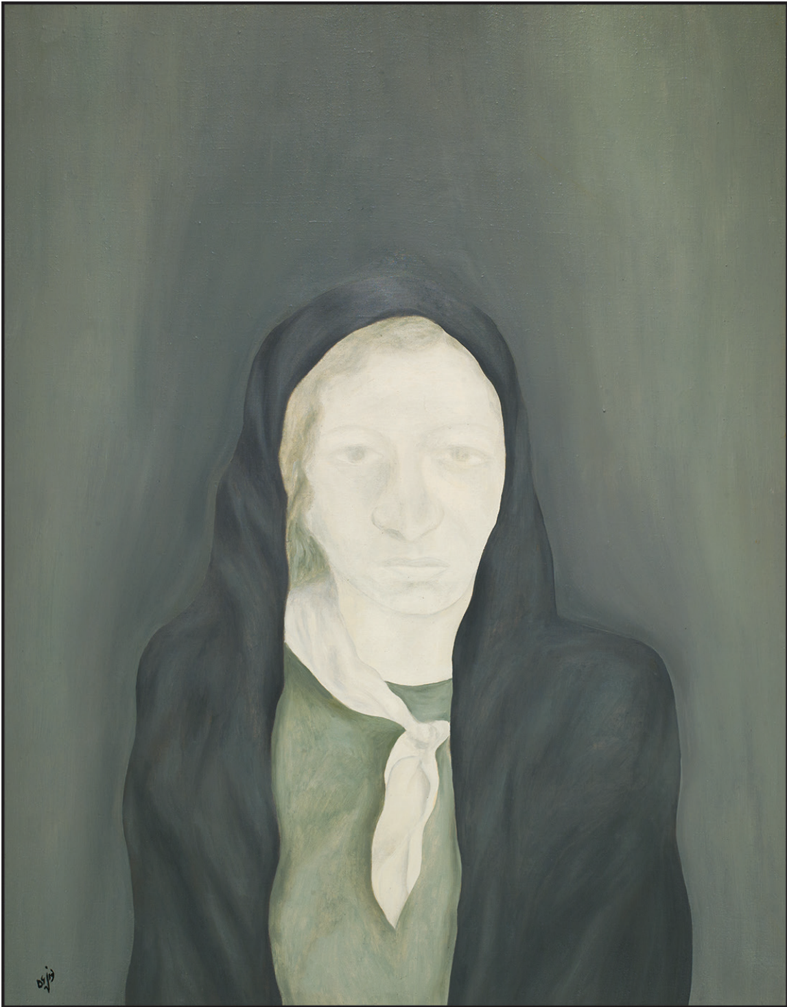
Untitled 1977 110x85 cm Oil on canvas