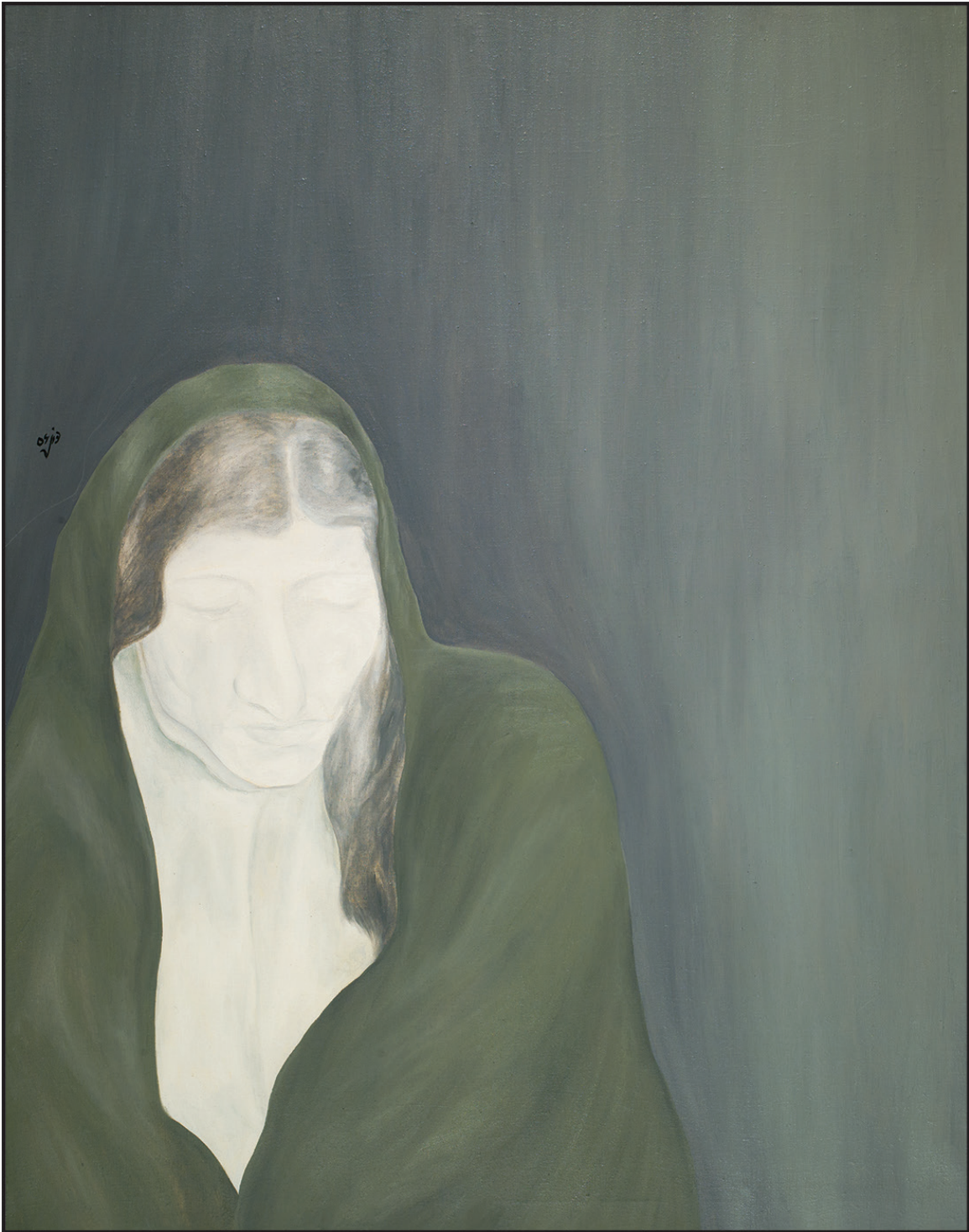
Untitled 1977 110x85 cm Oil on canvas