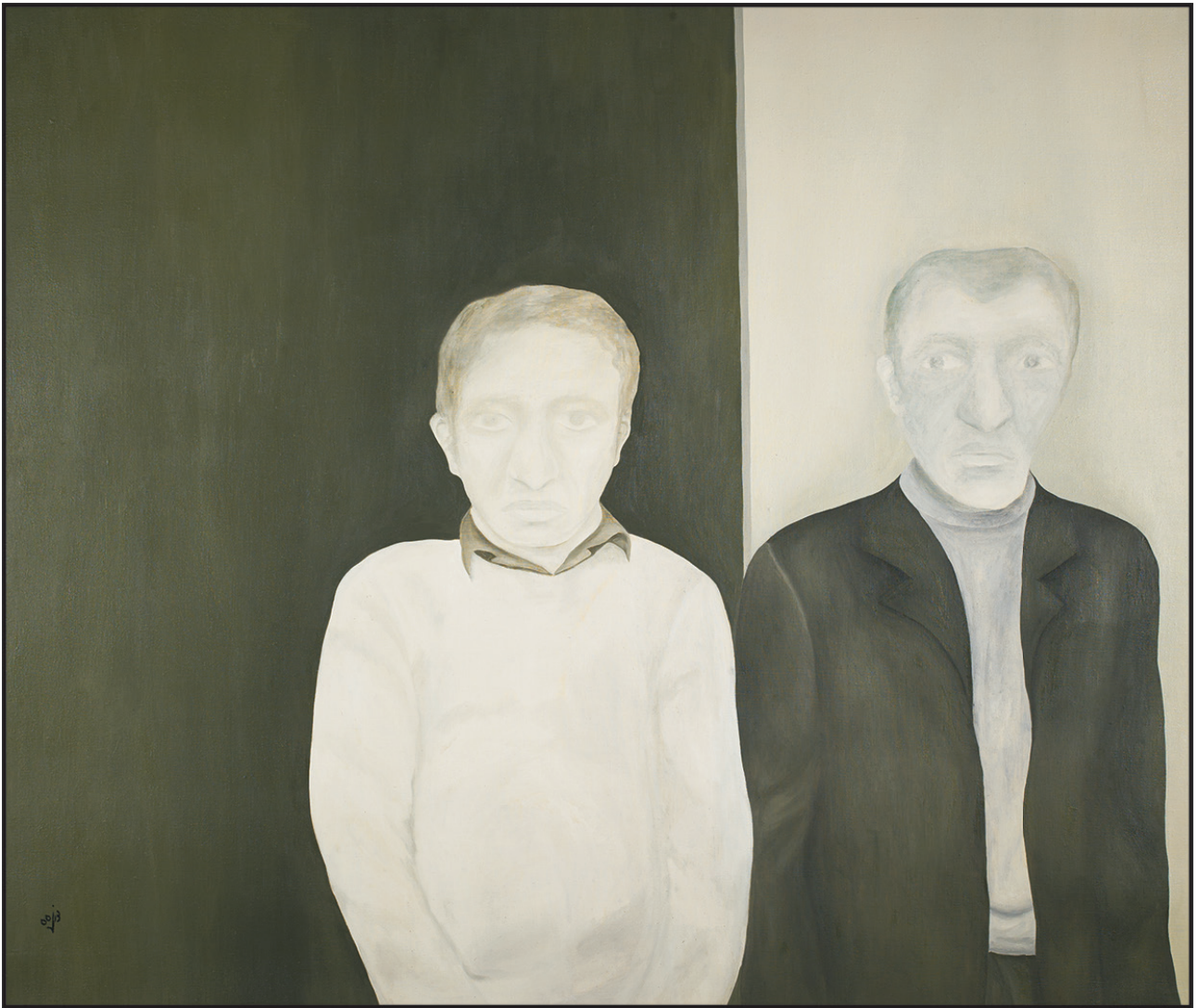
Untitled 1976 110x130 cm Oil on canvas