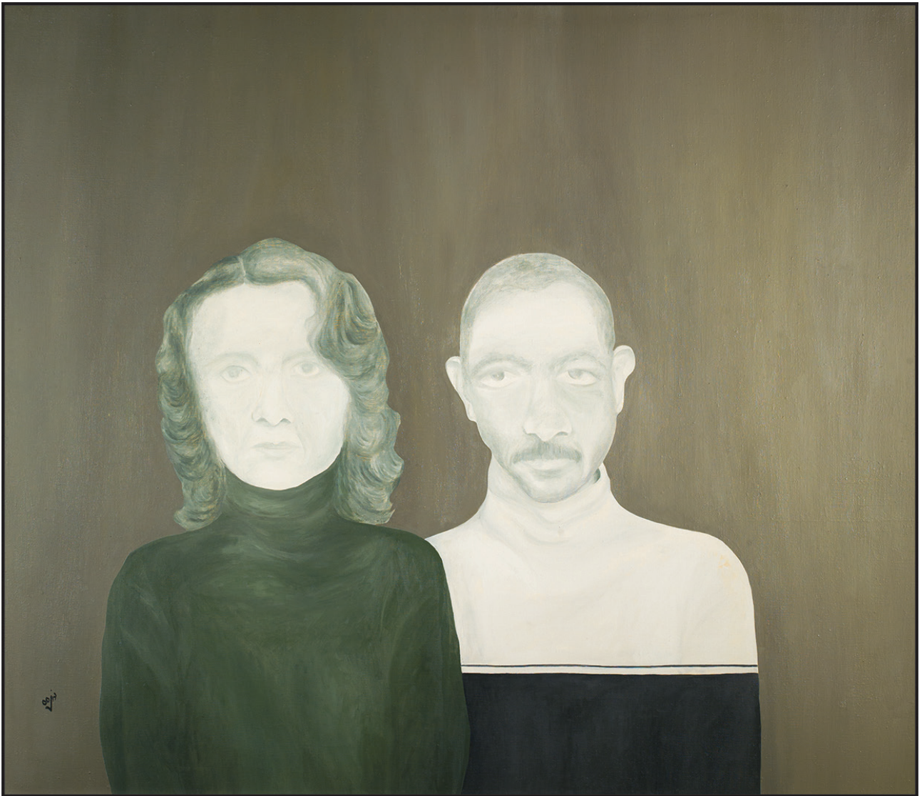
Untitled 1976 110x130 cm Oil on canvas