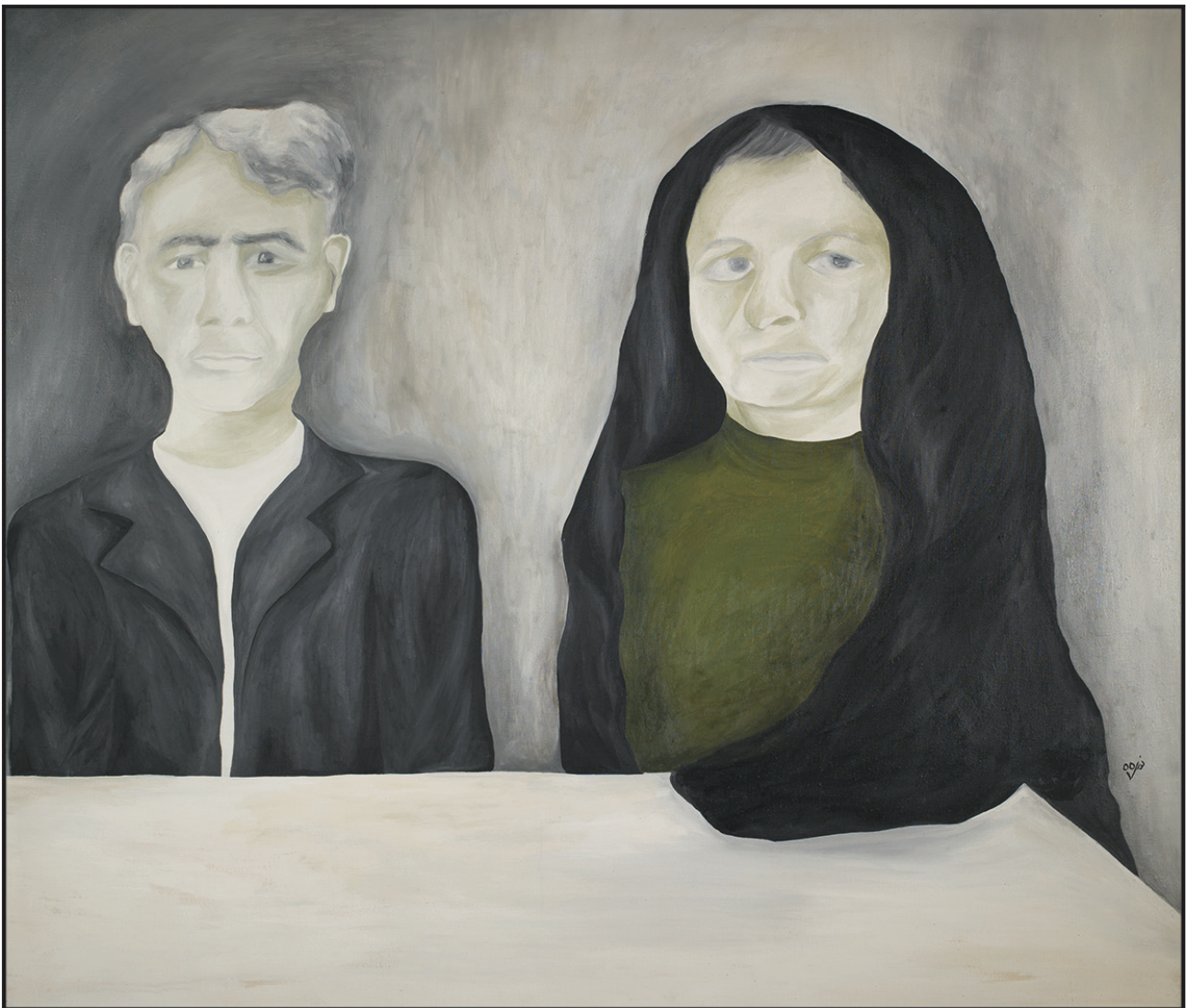
Untitled 1976 110x130 cm Oil on canvas