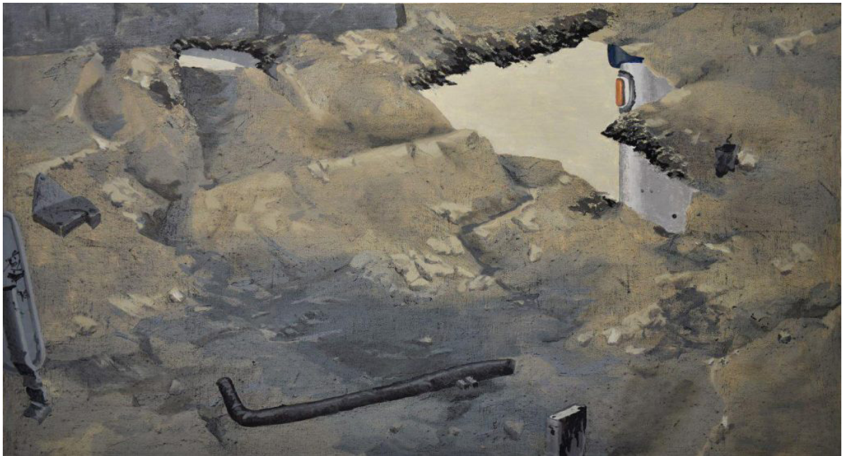
Tamol Mixed Media on canvas 100×180 cm 2016