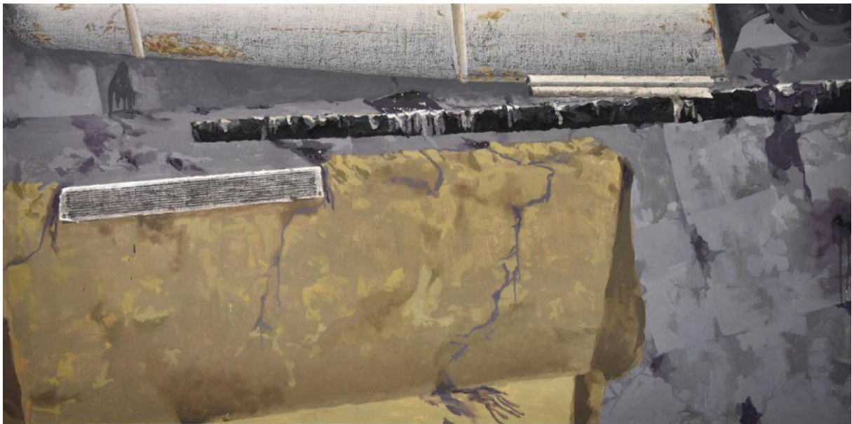
Chaliran Mixed Media on canvas 100×200 cm 2016