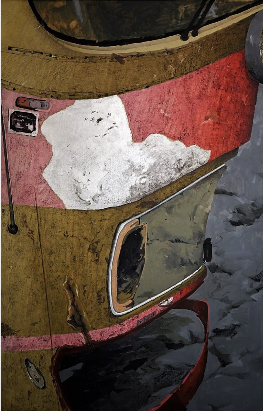
Mehshekan Mixed Media on canvas 200x140 cm 2015