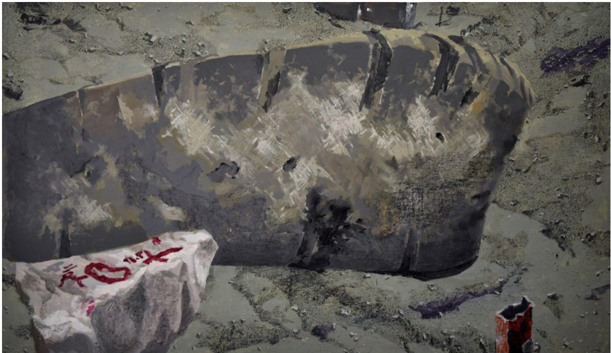
Charkhe-falak Mixed Media on canvas 100×170 cm 2016