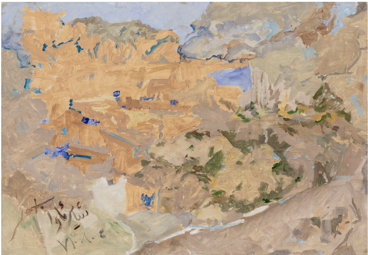
Shayvaava Village Oil on cardboard 70×100 cm 1994