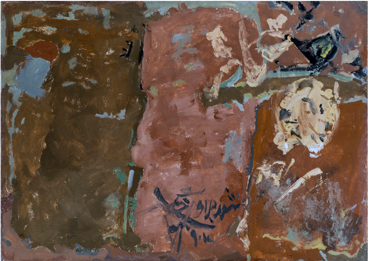
Shourblaw Village Oil on cardboard 70×100 cm 1994