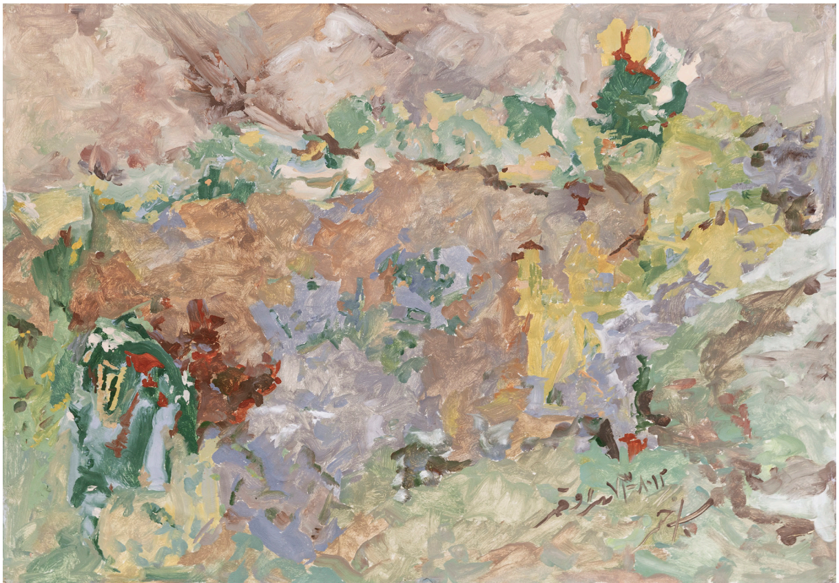
Sarauvghamar Village Oil on cardboard 70×100 cm 1994