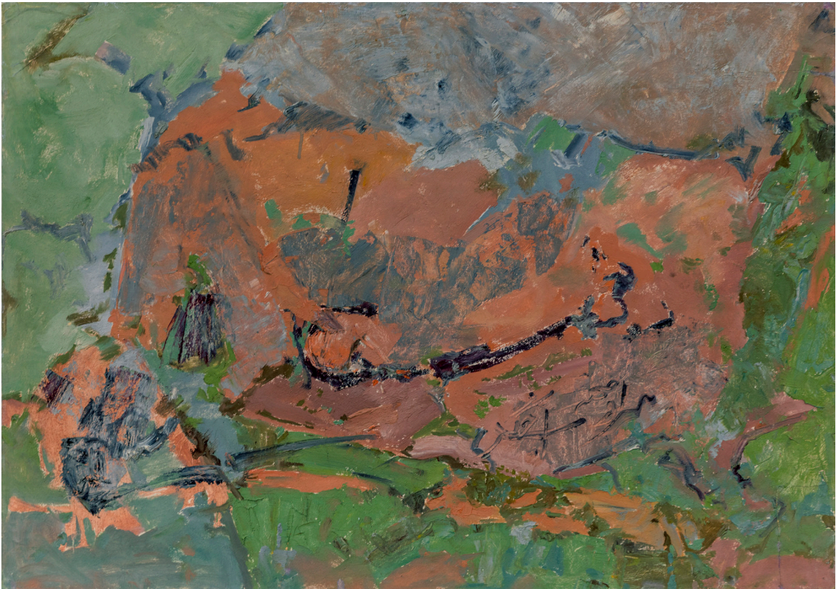
Serawghamar Village Oil on cardboard 70×100 cm 1994