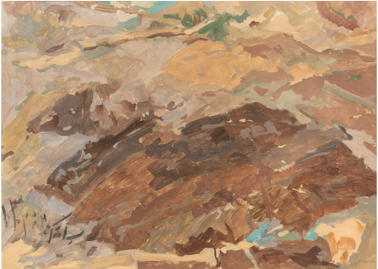
Bileh var village Oil on cardboard 50×70 cm 1994