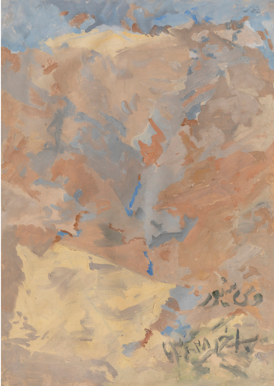
Vee Sour Village Oil on cardboard 70×50 cm 1994