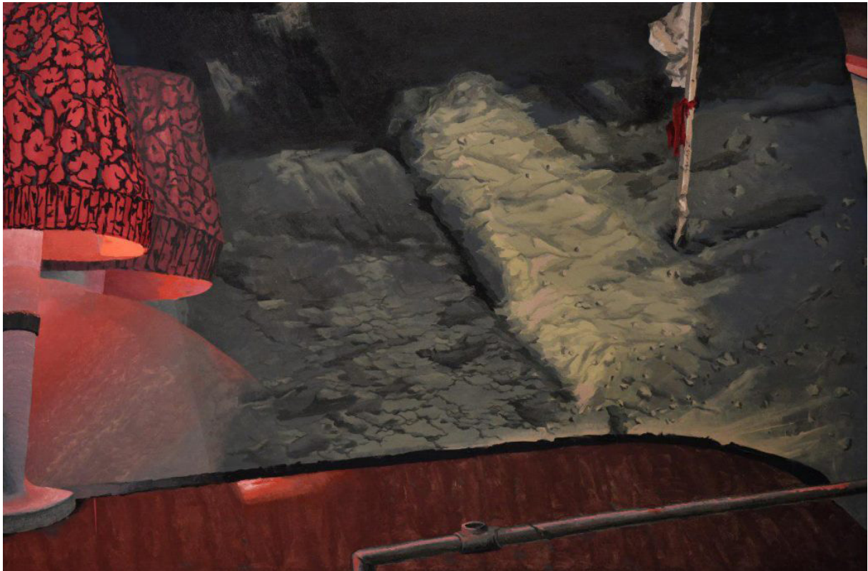
Shabkari Mixed Media on canvas 120×180 cm 2017