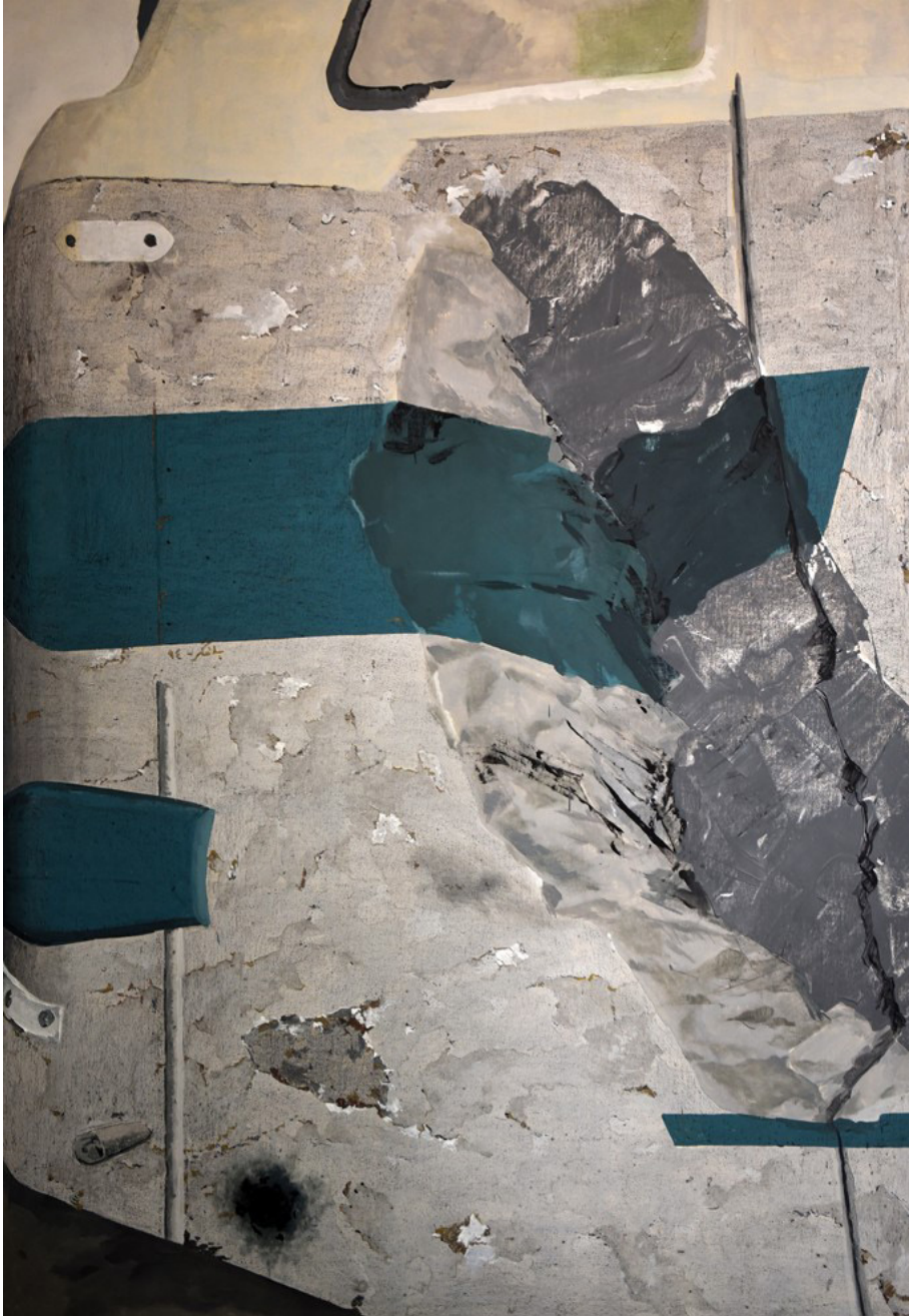
Auto-Khakestari Mixed Media on canvas 200×140 cm 2015