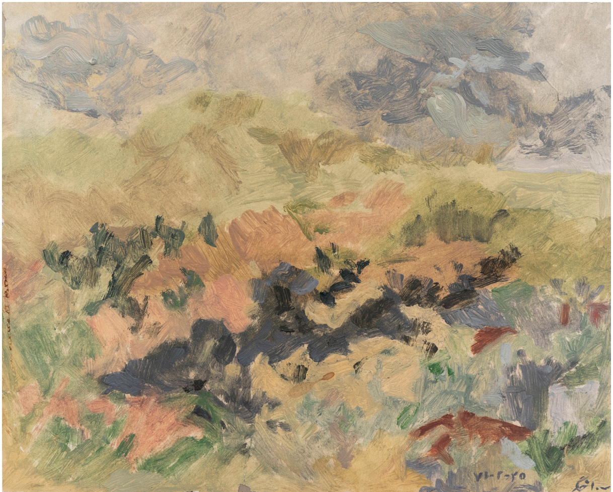
Serawghamar Village Oil on cardboard 22×27 cm 1992