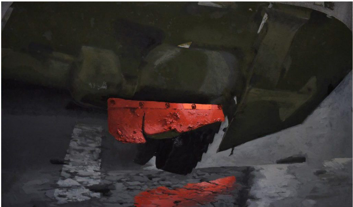
Zirzamin Collage 110×185 cm 2017