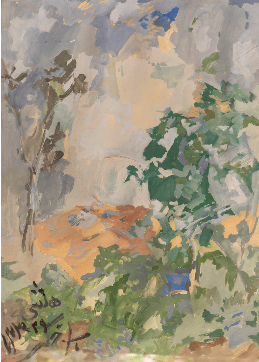
Halashi Village Oil on cardboard 70×50 cm 1994