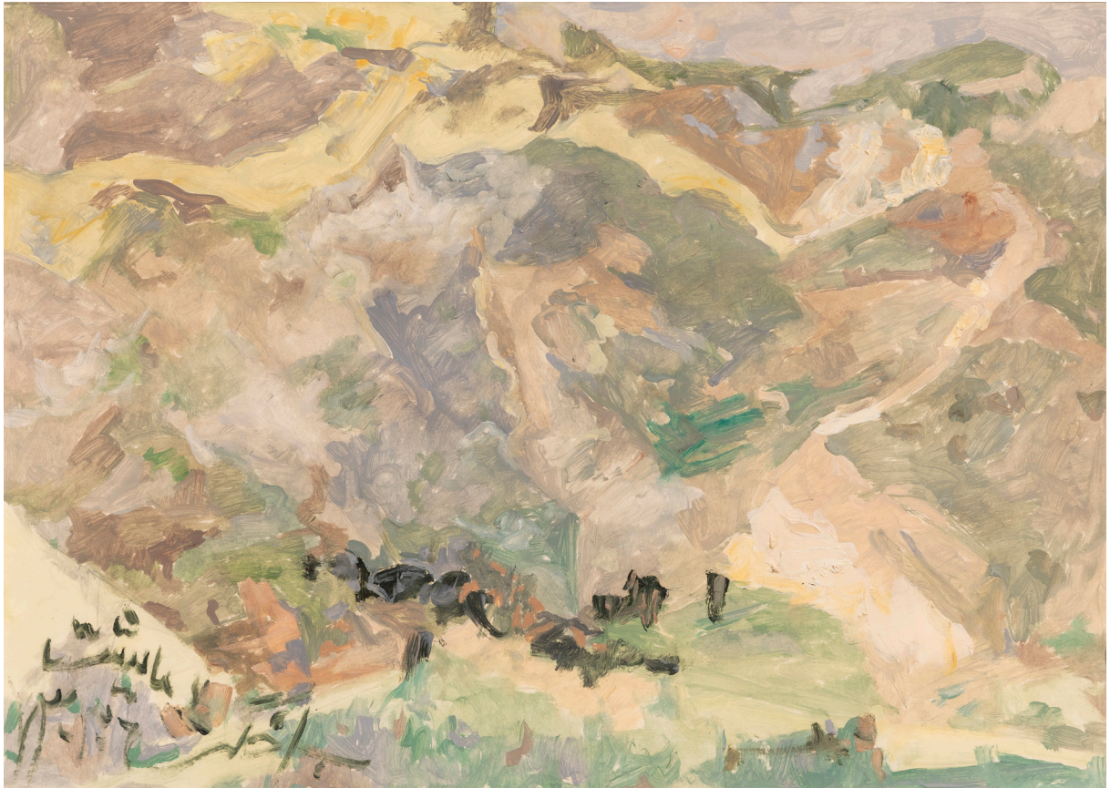
Mauyasht Village Oil on cardboard 50×70 cm 1994