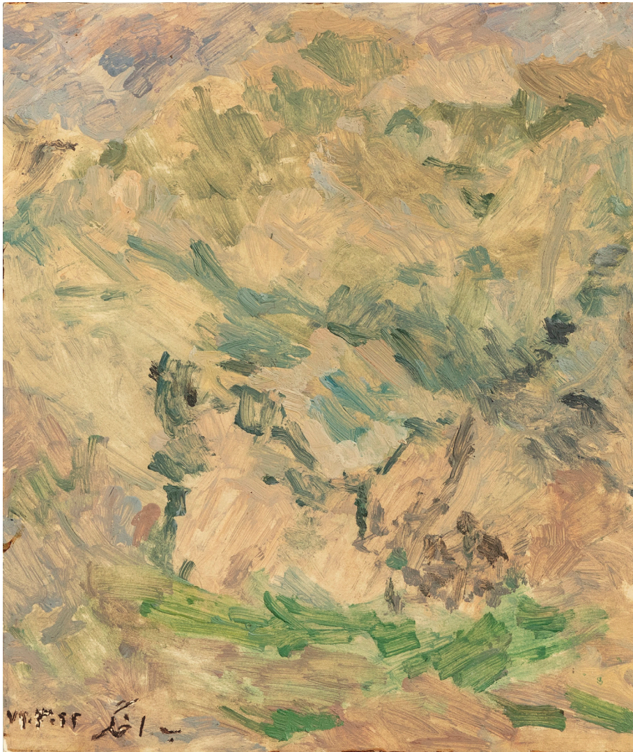
Bi houvar Village Oil on cardboard 27×22 cm 1994