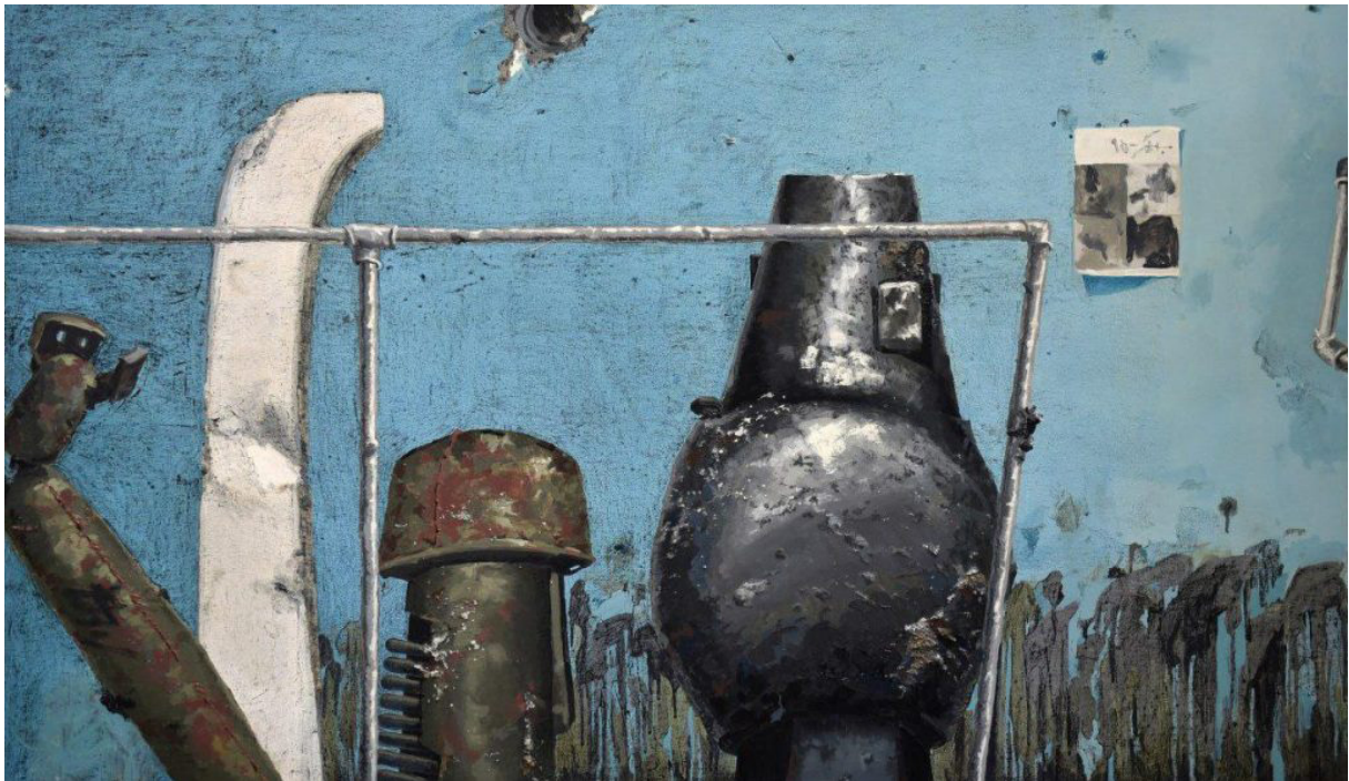
Chahar fasl Mixed Media on canvas 100×170 cm 2016