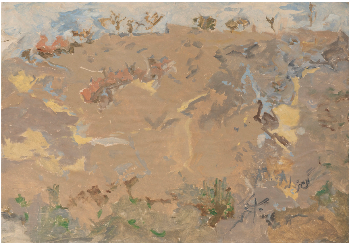
Gan zah lah Village Oil on cardboard 70×100 cm 1994