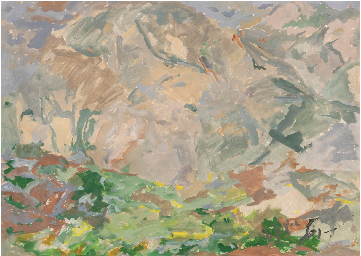
Nav der van village Oil on cardboard 50×70 cm 1993