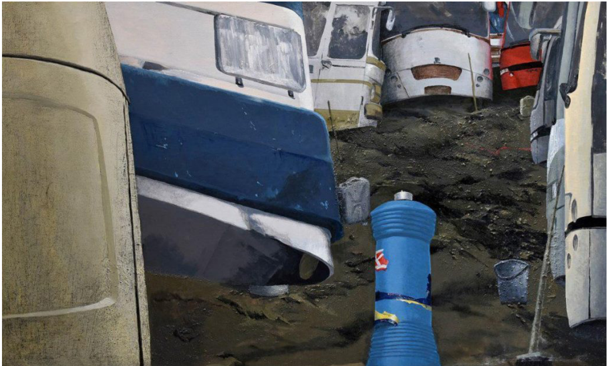
Totem Abade no Mixed Media on canvas 110x180 cm 2018