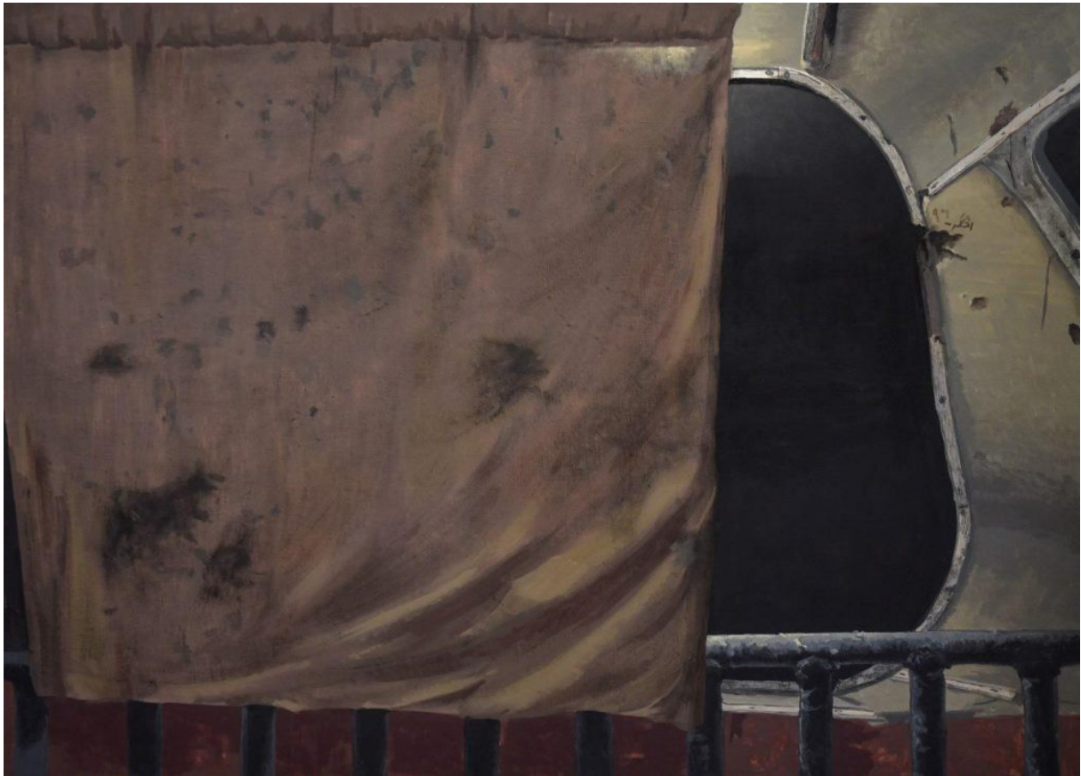
Nalaih Mixed Media on canvas 120x170 cm 2017