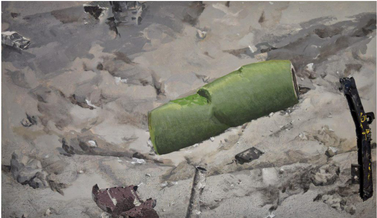
Filter Abad Mixed Media on canvas 100x170 cm 2016