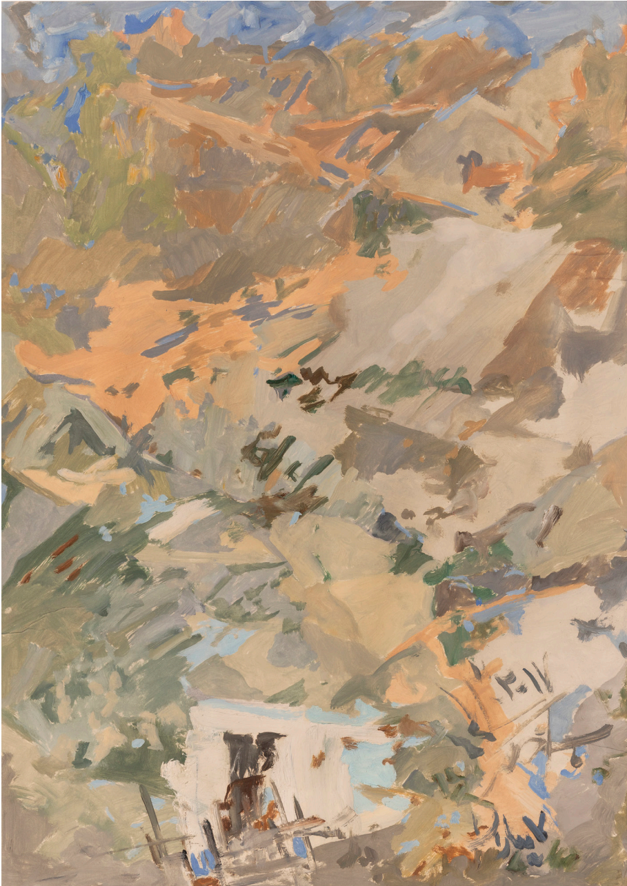
Kamyaran Area Oil on cardboard 70×50 cm 1994