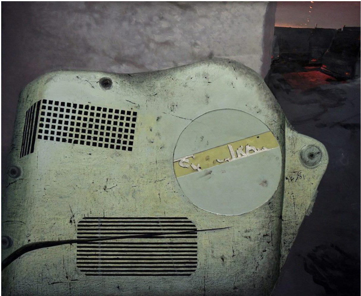
Sonee Irani Mixed Media on canvas 150x180 cm 2018