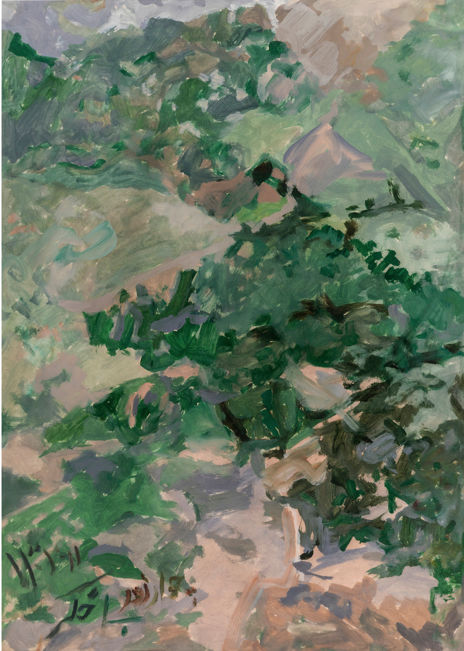
Chouvar zah var Village Oil on cardboard 70×50 cm 1994