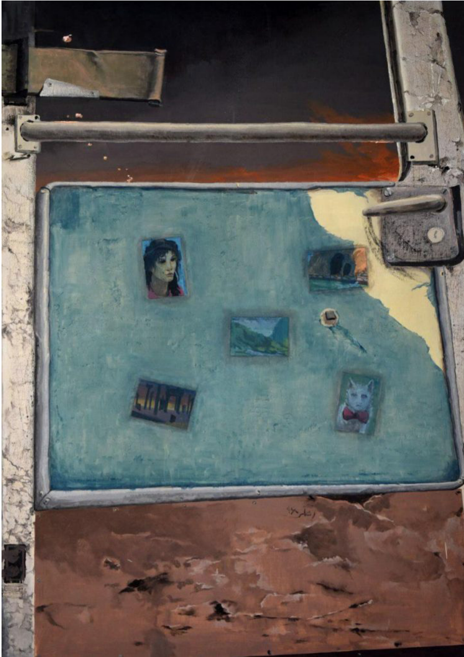
Iran khater Mixed Media on canvas 170×120 cm 2017