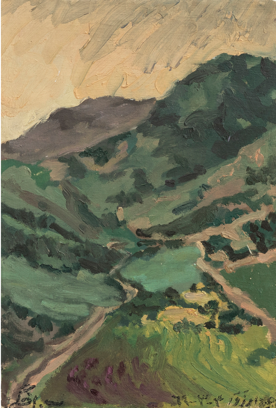
Chouvar zah var Village Oil on cardboard 29×20 cm 1990