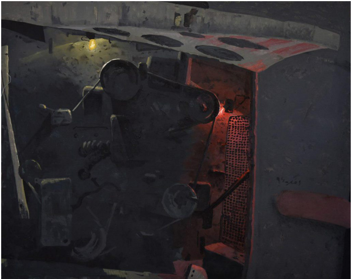
Shab shomar Mixed Media on canvas 120x150 cm 2017