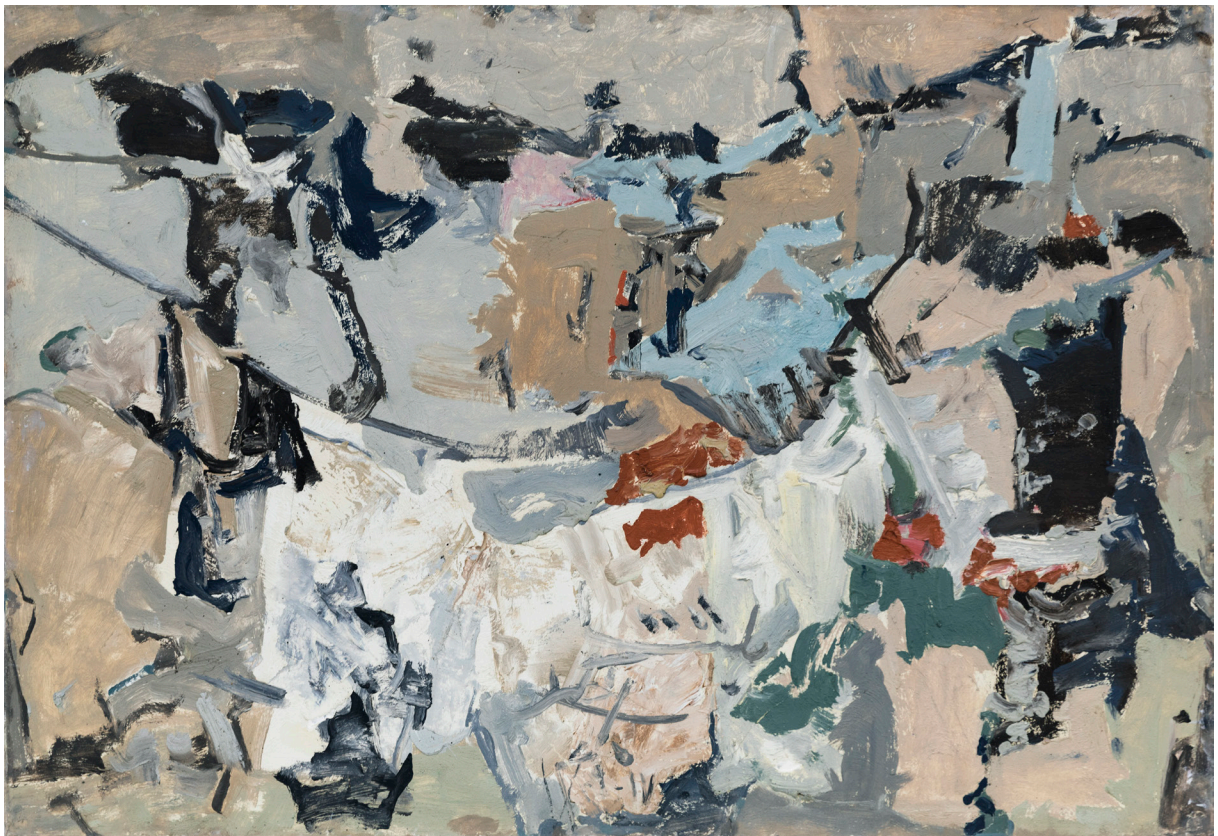
Beh lasht Village Oil on cardboard 70×100 cm 1995