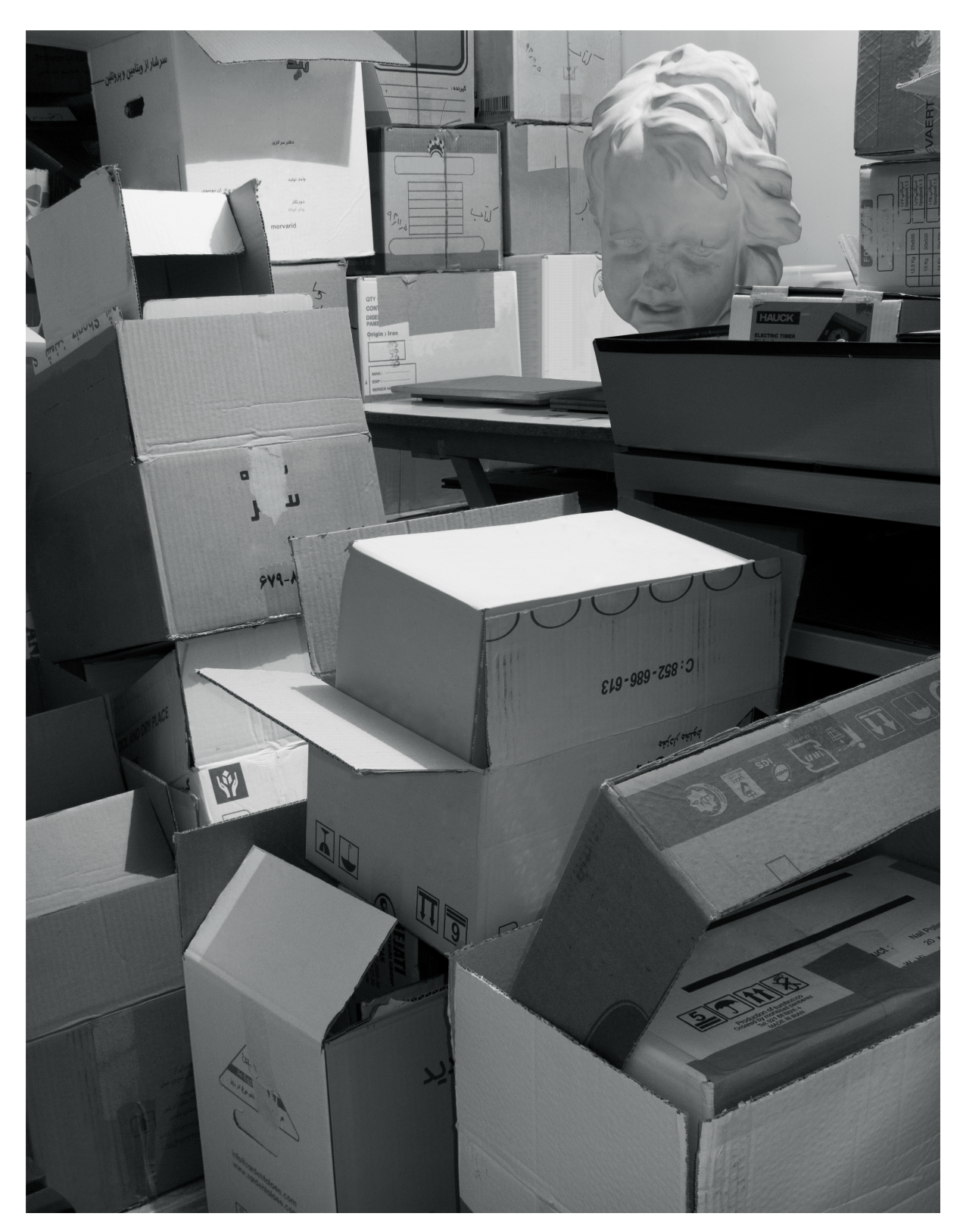
Digital Photography Digital print on semimatte professional photo paper 44×34 (60×50) cm 2015