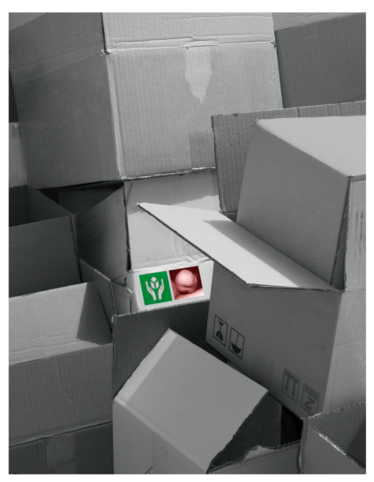
Digital Photography Digital print on semimatte professional photo paper 44×34 (60×50) cm 2015