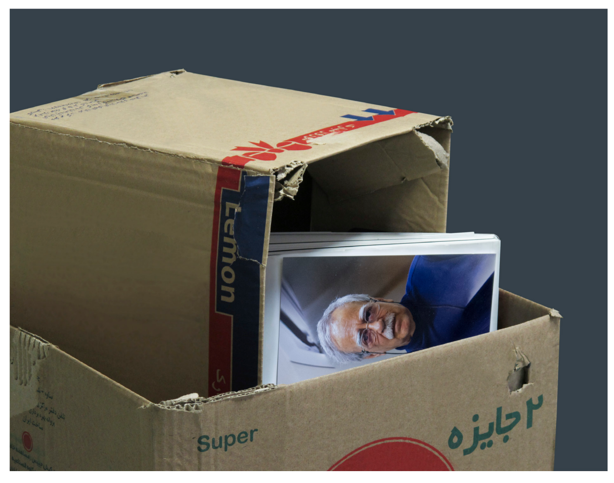
Digital Photography Digital print on semimatte professional photo paper 34×44 (50×60) cm 2015