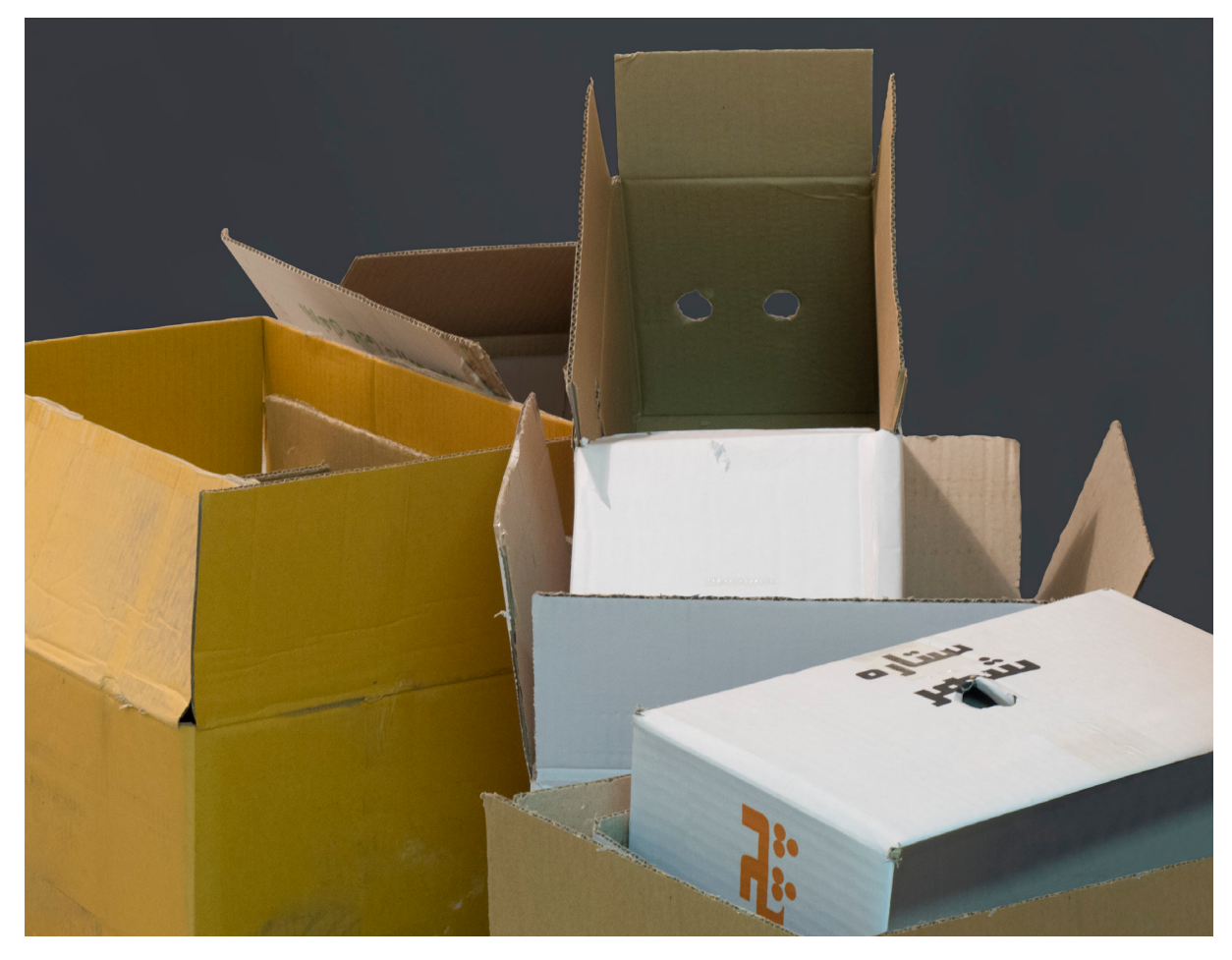
Digital Photography Digital print on semimatte professional photo paper 34×44 (50×60) cm 2015