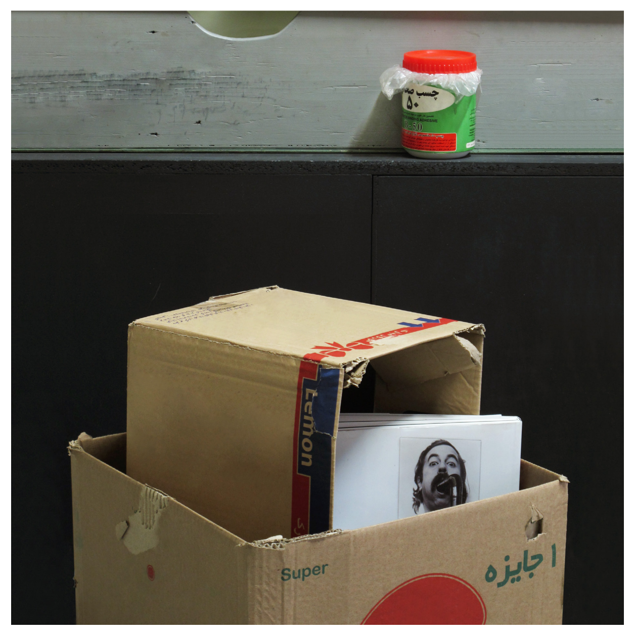
Digital Photography Digital print on semimatte professional photo paper 34×34 (50×50) cm 2015