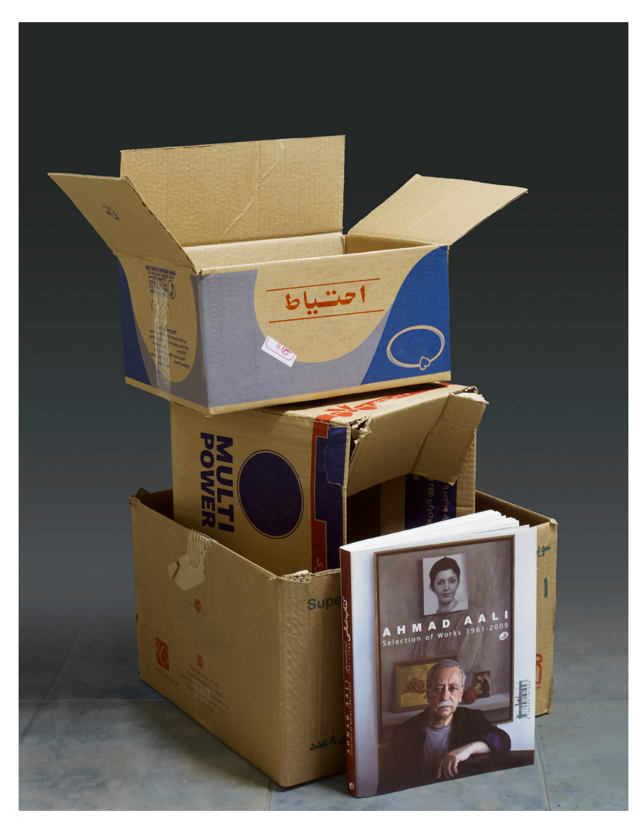
Digital Photography Digital print on semimatte professional photo paper 44×34 (60×50) cm 2015