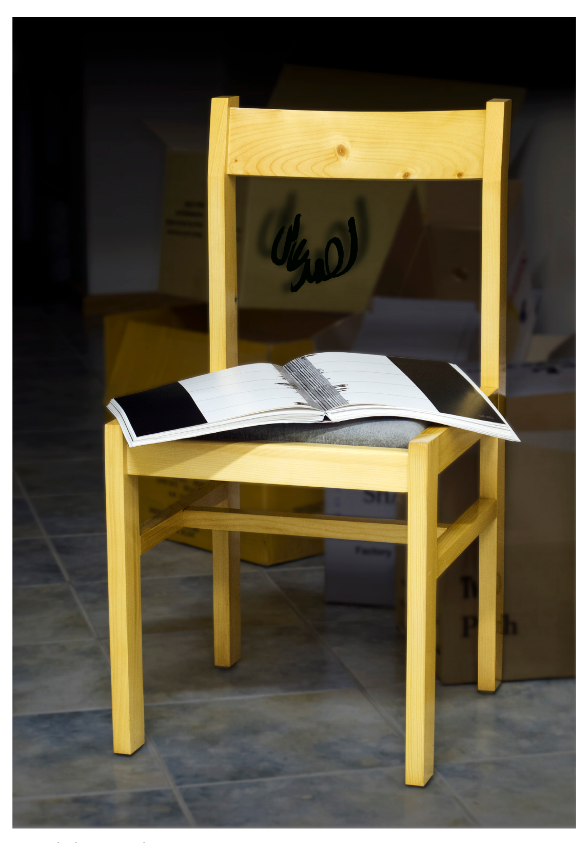
Digital Photography Digital print on semimatte professional photo paper 49×34 (65×50) cm 2015