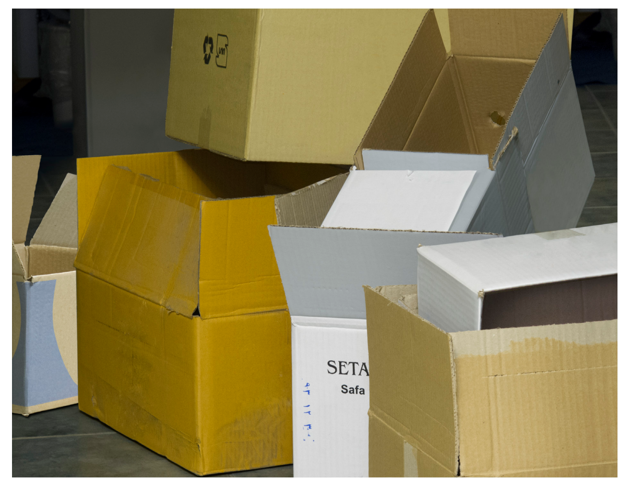
Digital Photography Digital print on semimatte professional photo paper 34×44 (50×60) cm 2015