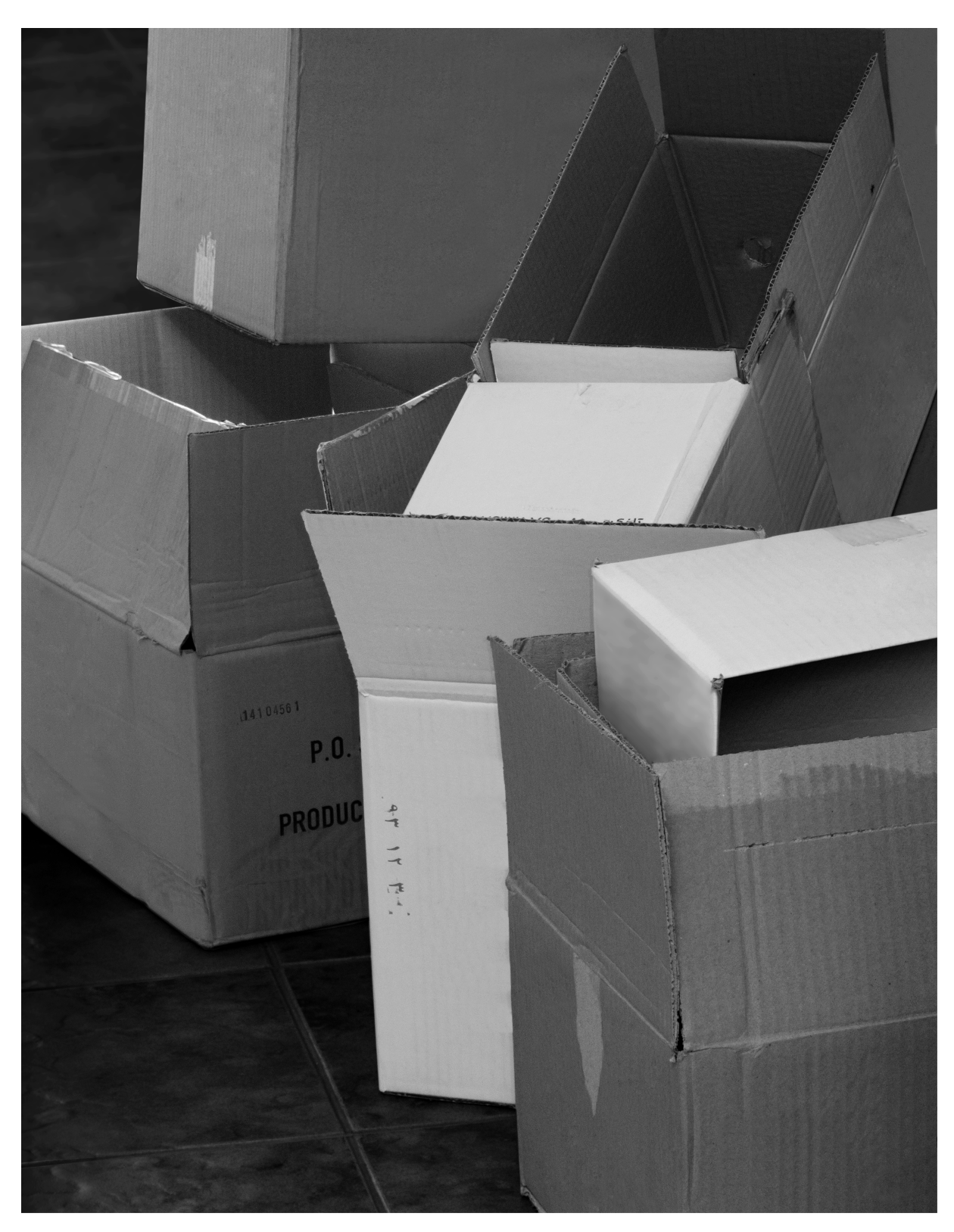
Digital Photography Digital print on semimatte professional photo paper 44×34 (60×50) cm 2015