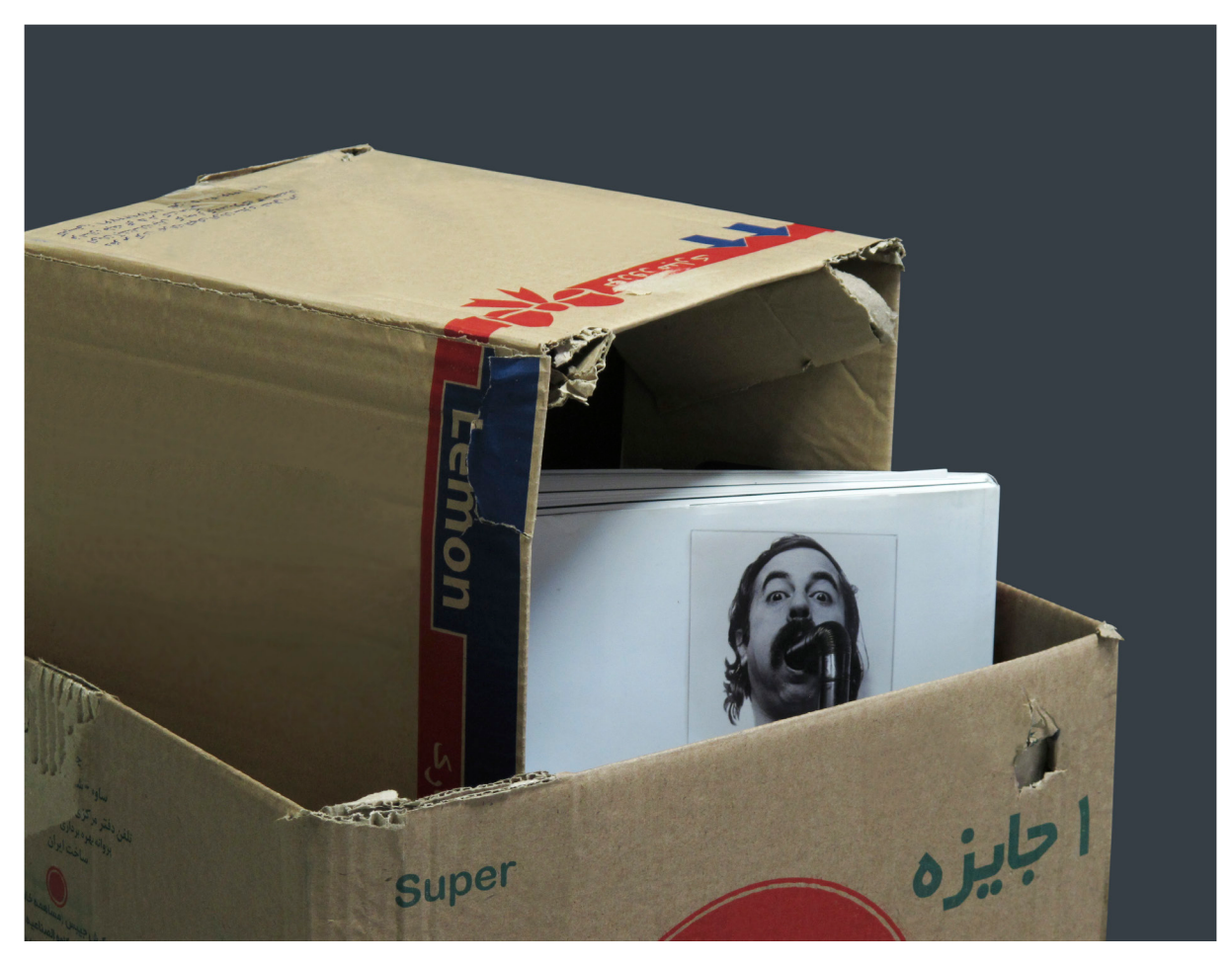
Digital Photography Digital print on semimatte professional photo paper 34×44 (50×60) cm 2015