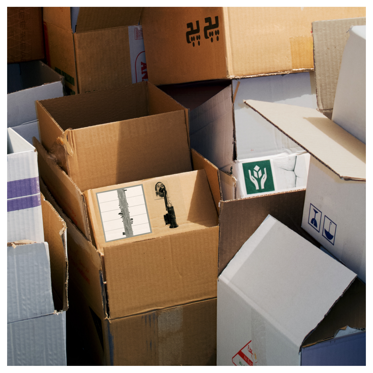
Digital Photography Digital print on semimatte professional photo paper 34×34 (50×50) cm 2015